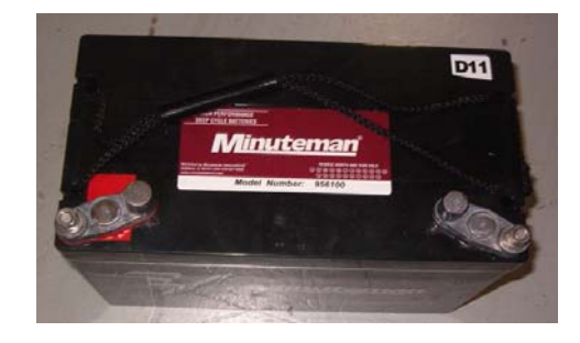
New 956100 AGM Battery

For further assistance, questions, or comments contact Technical Support at 800-982-7141 (USA)